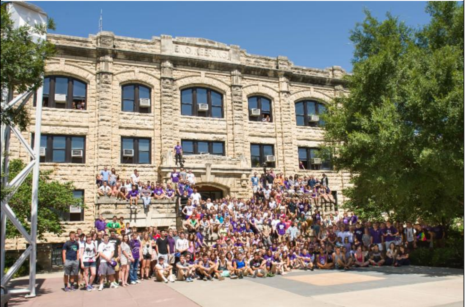
2013 APDesign All College Photo

College of Architecture, Planning &amp; Design