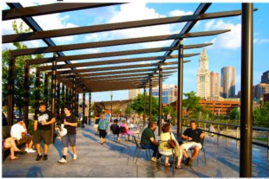
LARCP Distinguished Lecturer Series