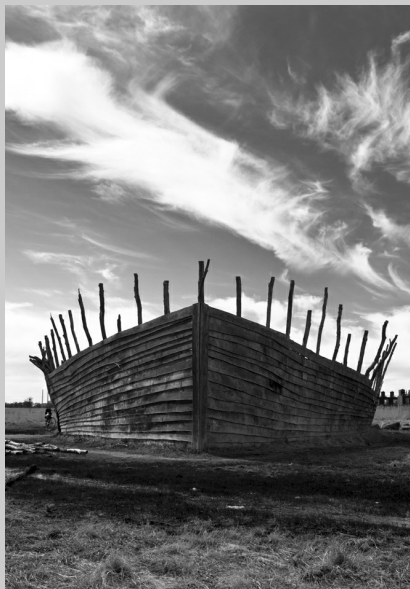
2013 Best in Show winner, Wesley Gross "Hull"

In this competition, professionals, will evaluate the five categories of competition: black & white, landscape, exterior architecture, interiors & architectural details, and other subject matter.