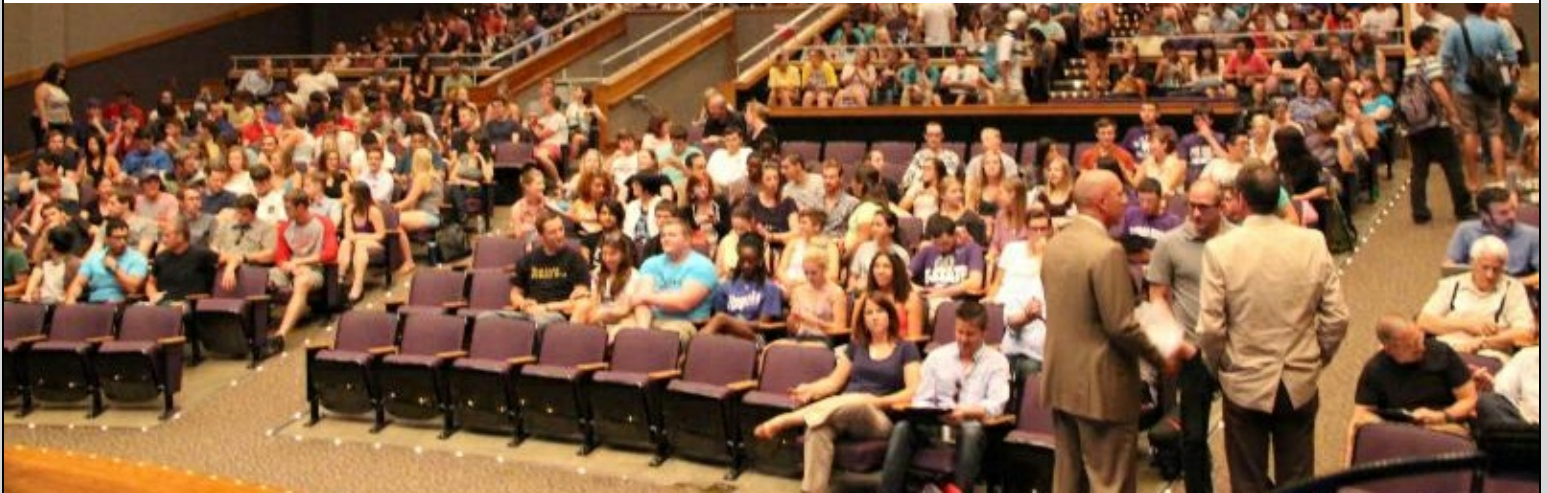
2013 All College Forum Lecture