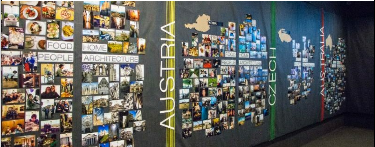
Study Abroad Exhibit in Chang Gallery through Oct 3rd

College of Architecture, Planning & Design