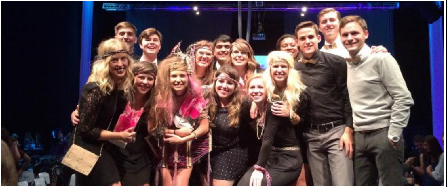
2014 Color + Couture

College of Architecture, Planning & Design