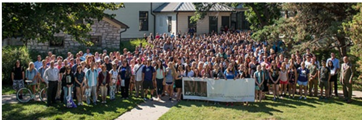
2015 All College Photo, Seaton Hall Expansion Location

THE COLLEGE of ARCHITECTURE, PLANNING & DESIGN // K-STATE