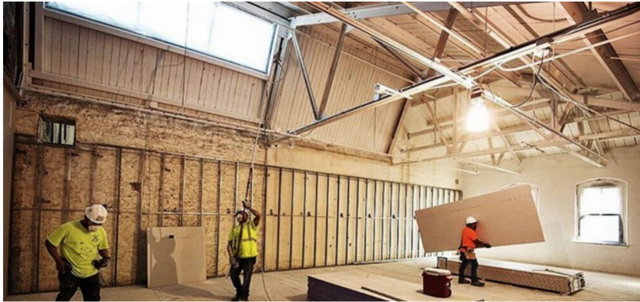
Painting and Sheetrocking on the second level of the expanded wing on Seaton Hall east.