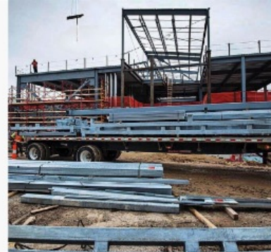
New Seaton East and Regnier Complex work continued all Summer

College of Architecture, Planning & Design