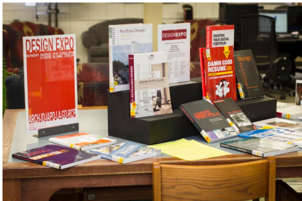
Check out Weigel Library's awesome display for invaluable DesignExpo resources!