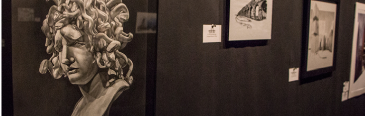
Images from the 2014 competition