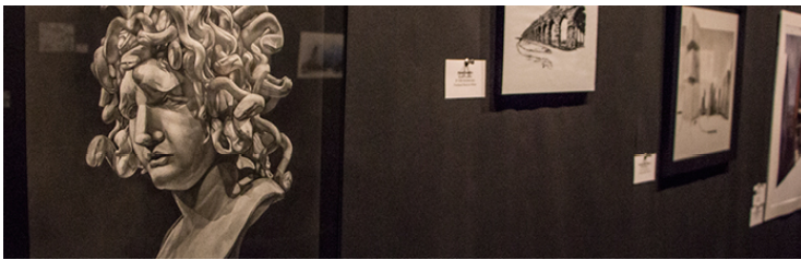
Images from the 2014 competition