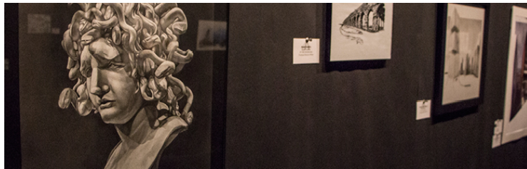
Images from the 2014 competition