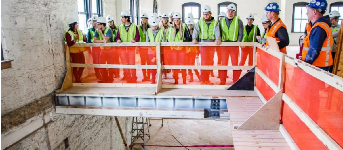
ENVD class taking a tour of the building site.

College of Architecture, Planning & Design