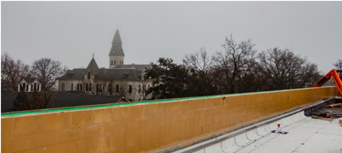
View from the top - The Ekdahl balcony view