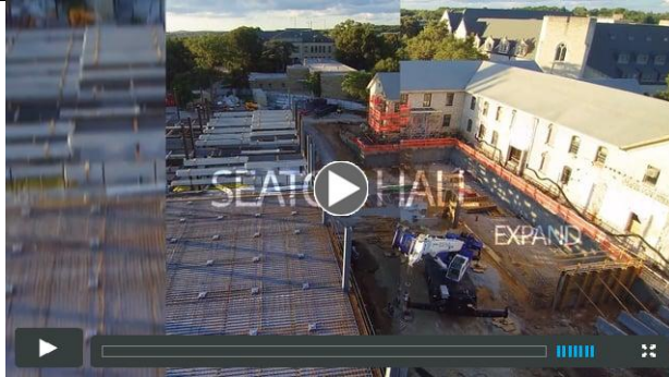
Seaton Hall From Above