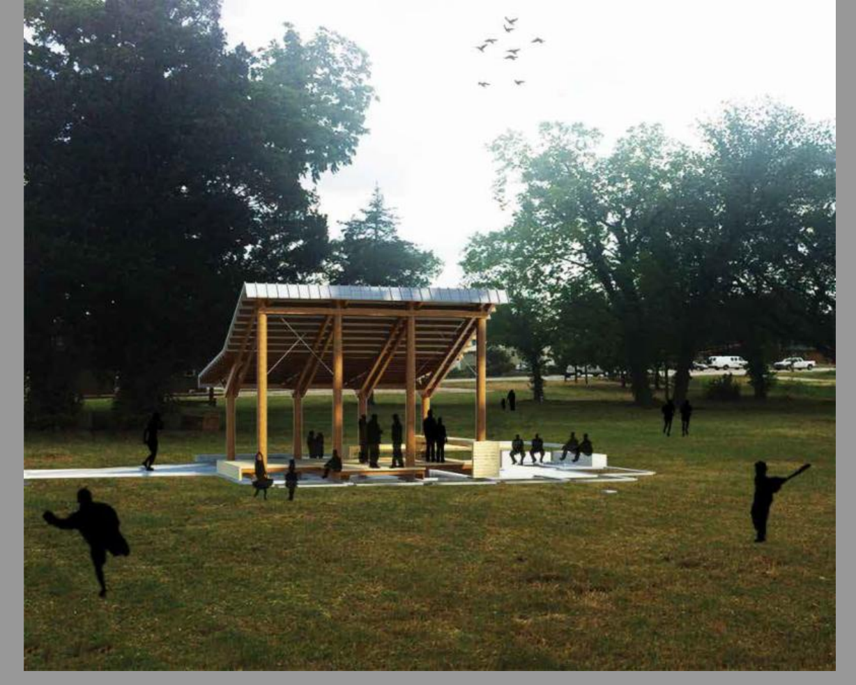
Rendering of Eureka Spring Park Pavilion courtesy of Todd Gabbard.

This weekend saw the start of construction of the Eureka Spring Park Pavilion, a project of the Department of Architecture's Small Town Studio. The fifth-year studio has been planning the construction since the beginning of the semester. Eureka Spring Park, a half-block away from the significant intersection of Eureka's Main Street and Highway 54, memorializes the founding of the town in 1857. The pavilion was conceived as a beacon for visitors to the town as well as a means to increase the recreational infrastructure available to the citizens of Eureka, KS.