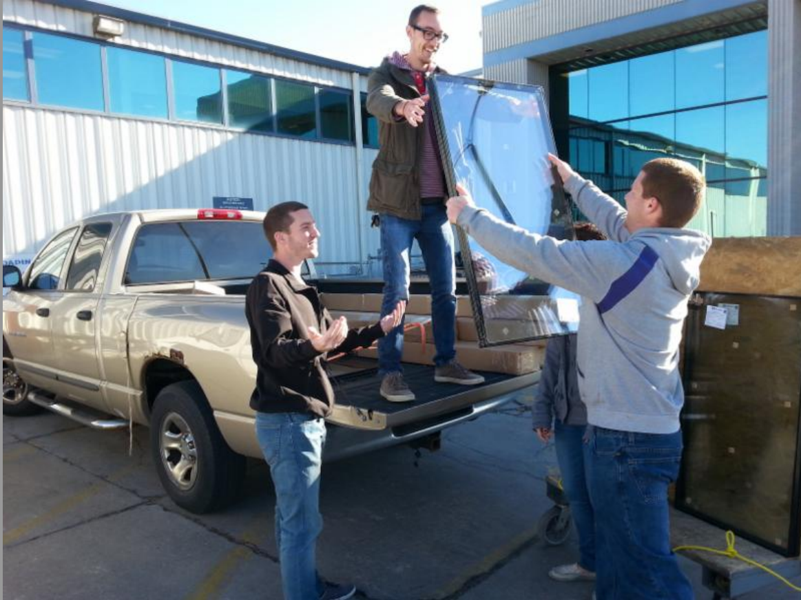
Gibson's students in action, photos courtesy of Gibson.