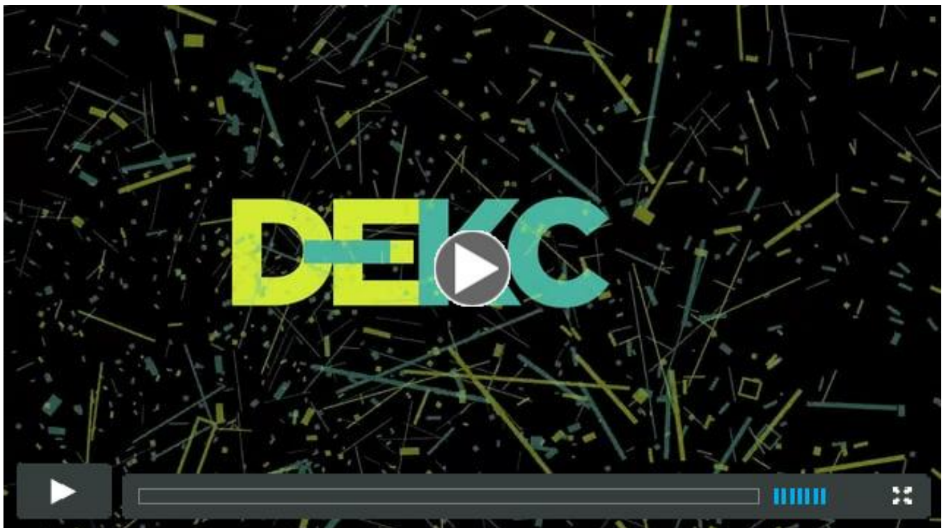
Kessler Park Water Reservoir Repurposing Vision Study Jury Comments courtesy of AIA KC.