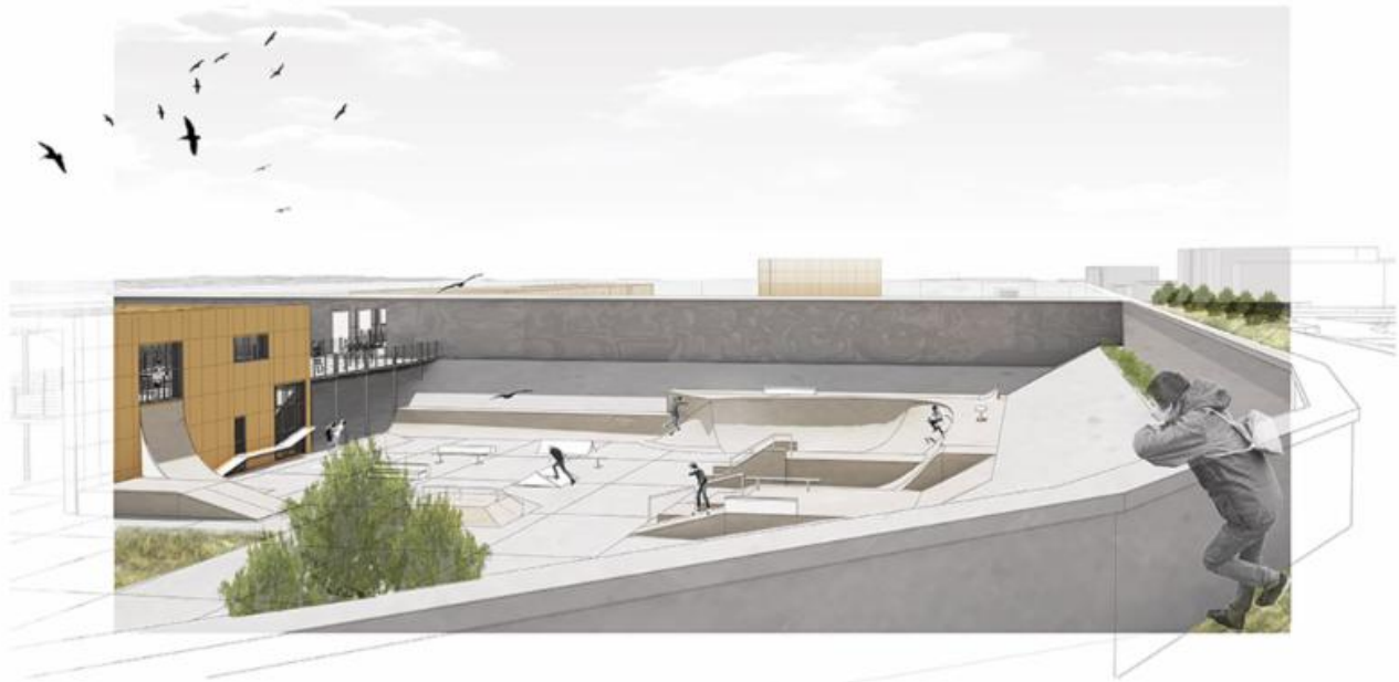
Image of the award winning "Rediscovering: Kessler Park Water Reservoir Repurposing Vision Study" project.