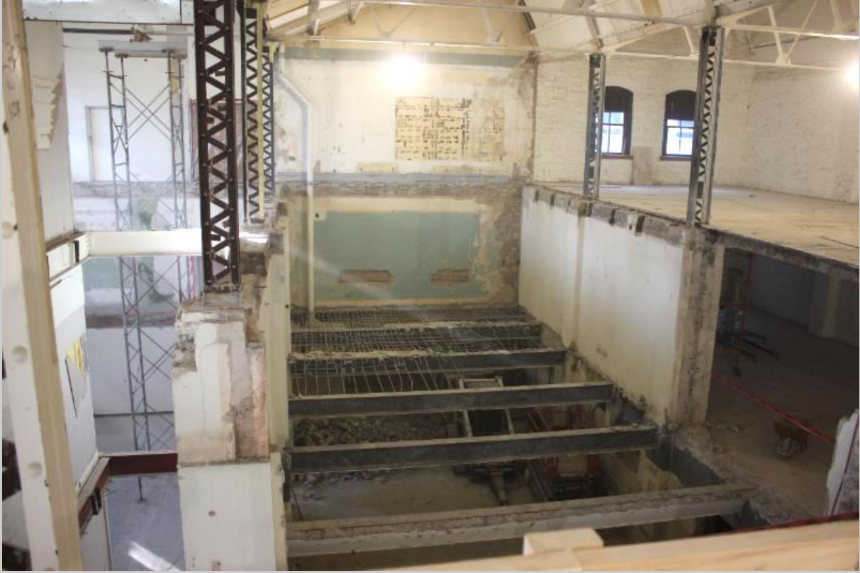
Second floor of Seaton looking down into the old Plot Room , photo courtesy of Becky O'Donnell.