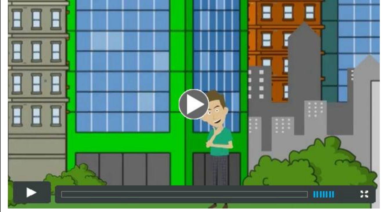
What is LEED - LEED Training - LeadingGreen

LeadingGreen will offer a LEED Green Associates Training at K-State on Sunday, February 14th from 1:00 to 5:00 pm. The course will include all necessary course materials (study guide, charts and mock exams), in-depth overview of LEED including all topics covered on the exam and a focus on heavily weighted topics, and how to register, prepare and pass the LEED GA exam. For more information on this course and to reserve your spot <u>click here.</u>