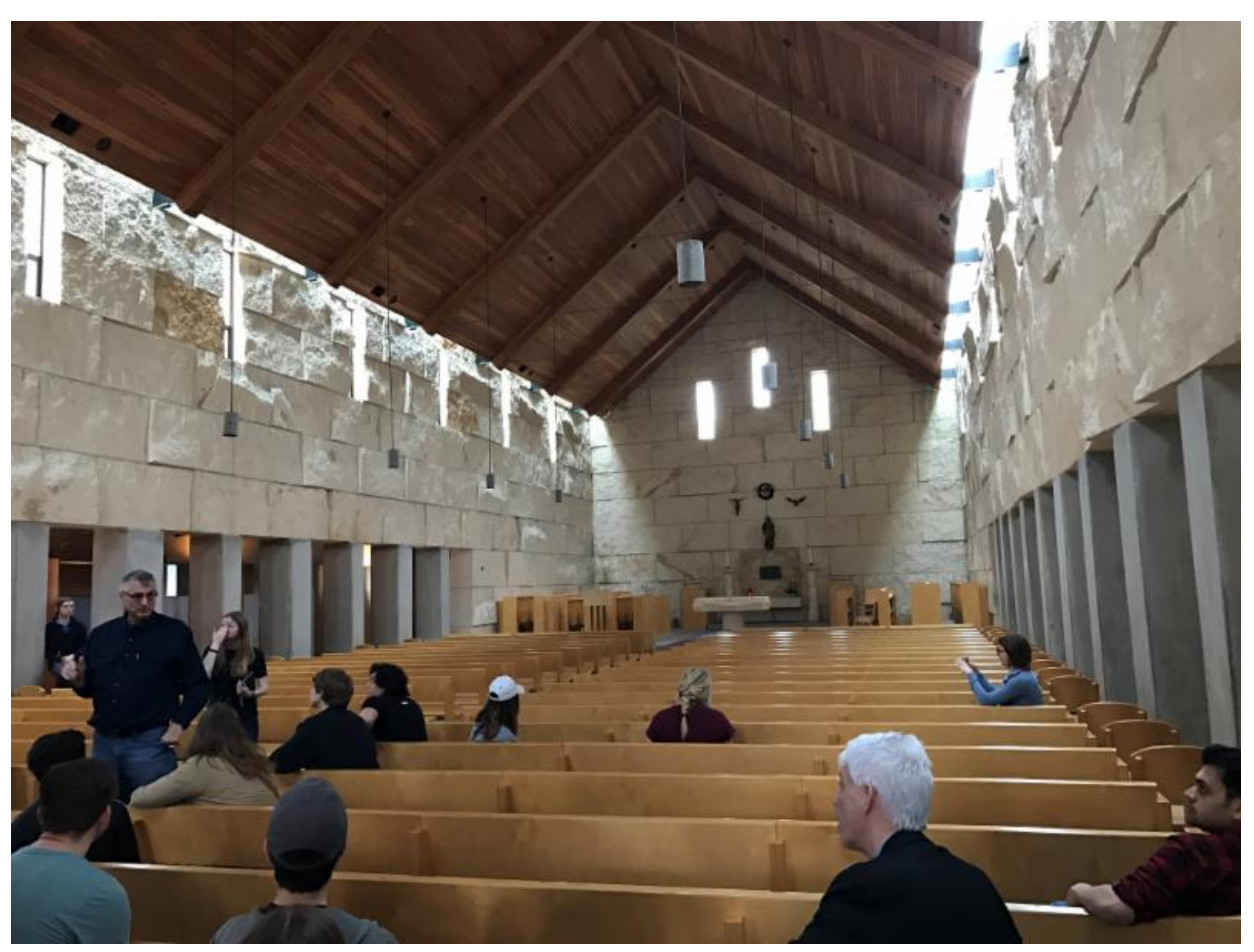
Students at Cistercian Abbey in Irving, TX