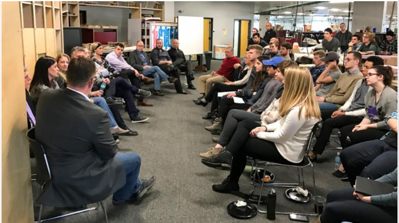
Photo taken last Friday at 'Ask an Architect' with the Professional Advisory Board members