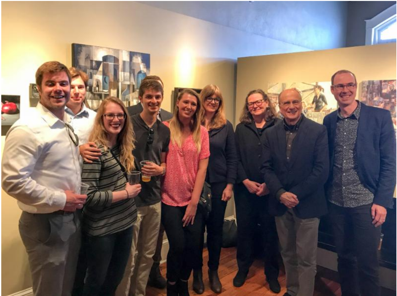
Design+make students pictured above with the HK jurors