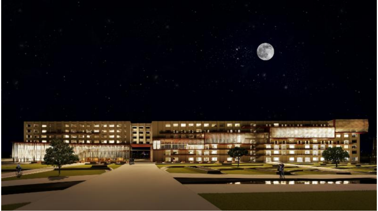
Tara Sears' project 'Atlanta Bazaar'