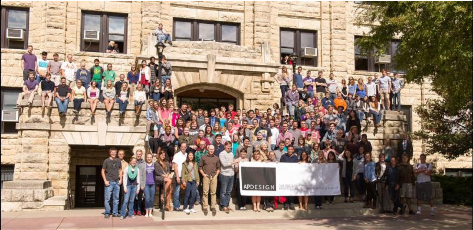
2014 APDesign All College Photo

College of Architecture, Planning & Design