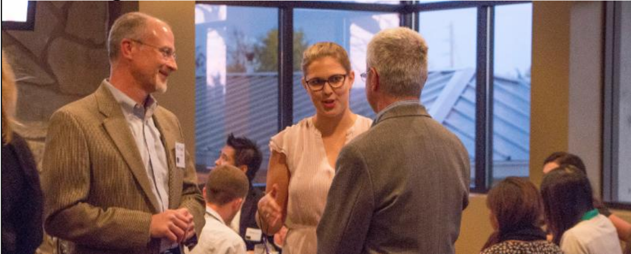
2014 Annual Scholarship Reception