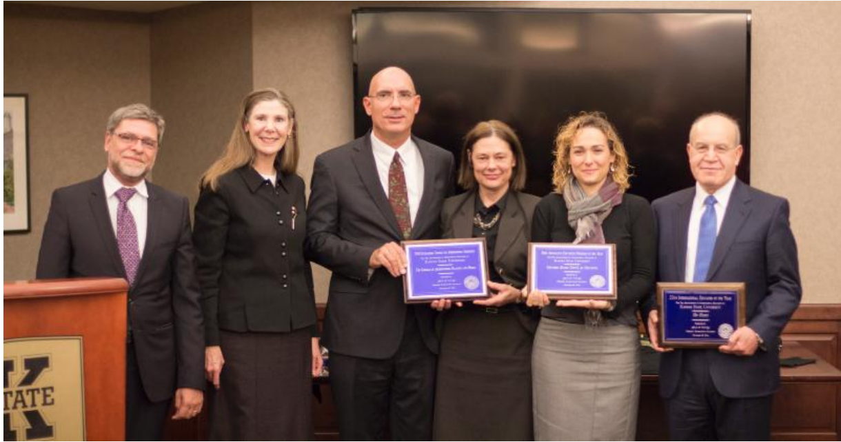
K-State International Education of the Year Awards Reception, Tuesday, November 18th