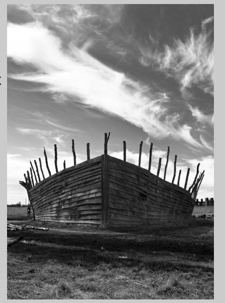
2013 Best in Show winner, Wesley Gross "Hull"

In this competition, professionals, will evaluate the five categories of competition: black & white, landscape,