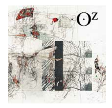
Click here to purchase your copy