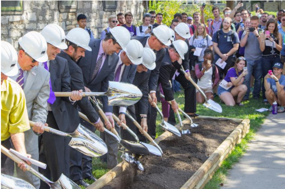
Breaking Ground on the Future of APDesign

THE COLLEGE of ARCHITECTURE, PLANNING & DESIGN // K-STATE