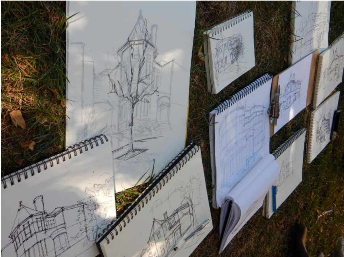
Images from Frank Ching's Drawing workshop

THE COLLEGE of ARCHITECTURE, PLANNING & DESIGN // K-STATE