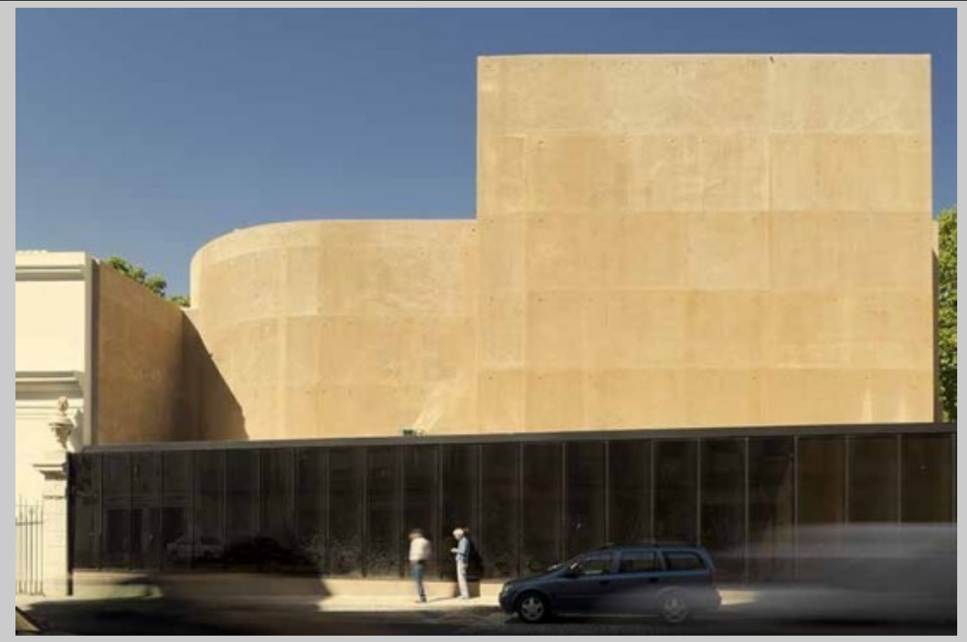
2008 Teatro Thalia Lisboa Portugal-Goncalo Byrne Lecture TODAY!

APDESIGN THE COLLEGE of ARCHITECTURE, PLANNING & DESIGN // K-STATE