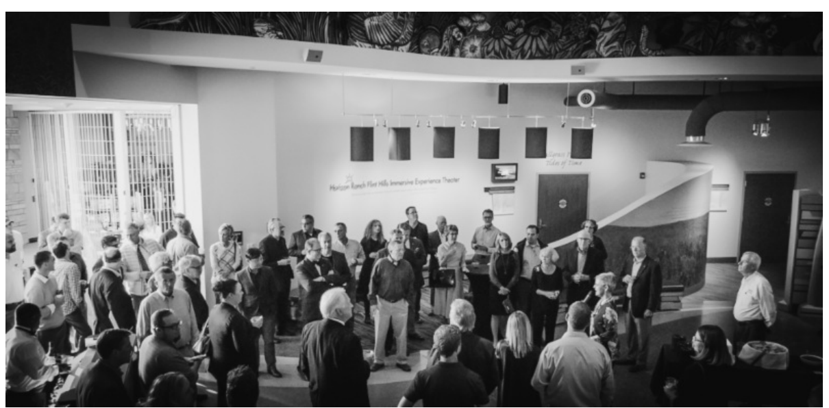
2016 AIA Central State Region Conference - Co-Hosted by APDesign this weekend