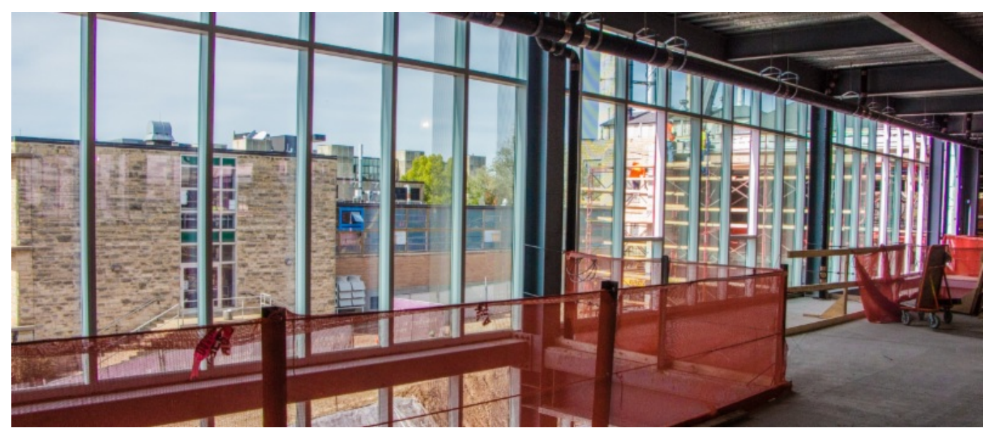
Windows going in on the west side of the new construction