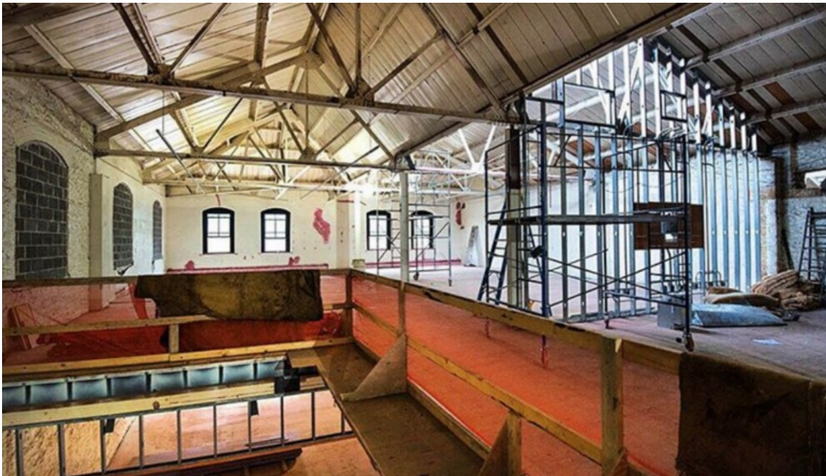
View of Seaton second floor renovation

College of Architecture, Planning & Design