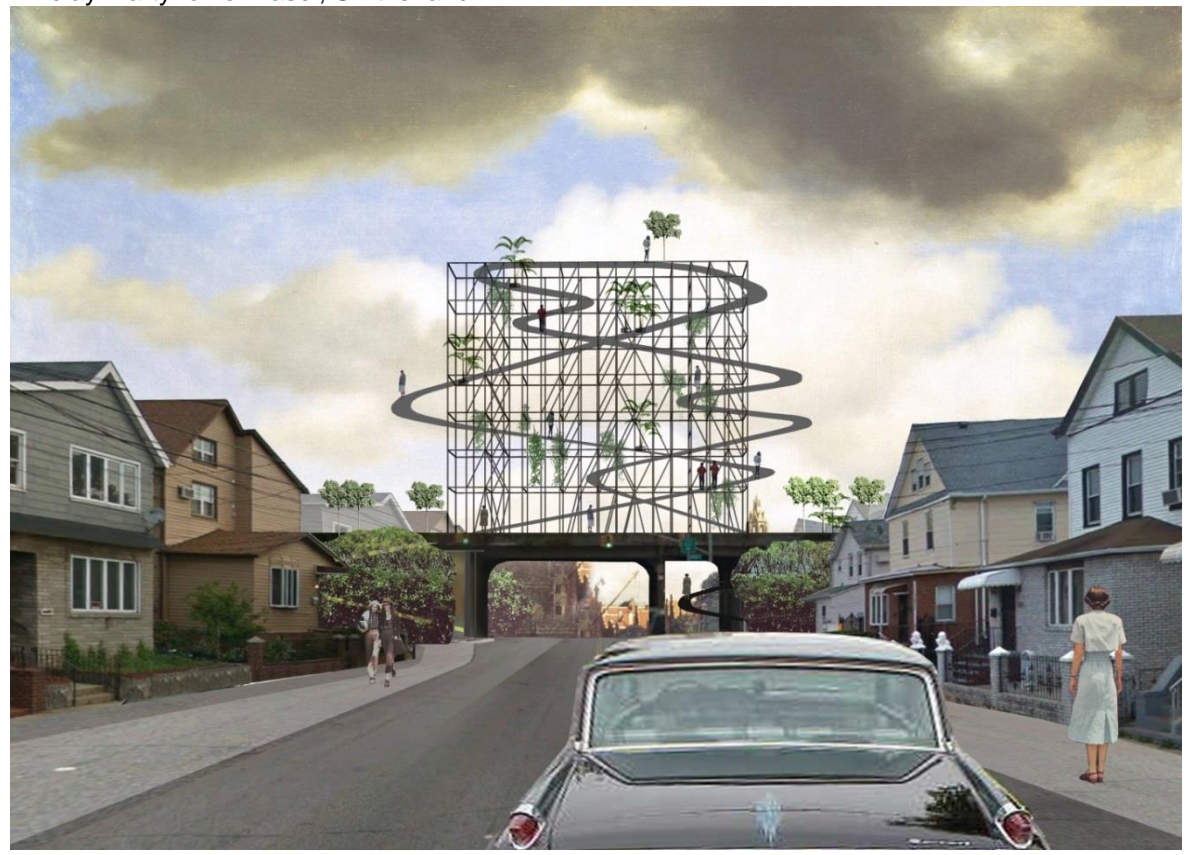
3rd Prize, $1000 Make It! Grow It! Song Deng of Toronto, Canada