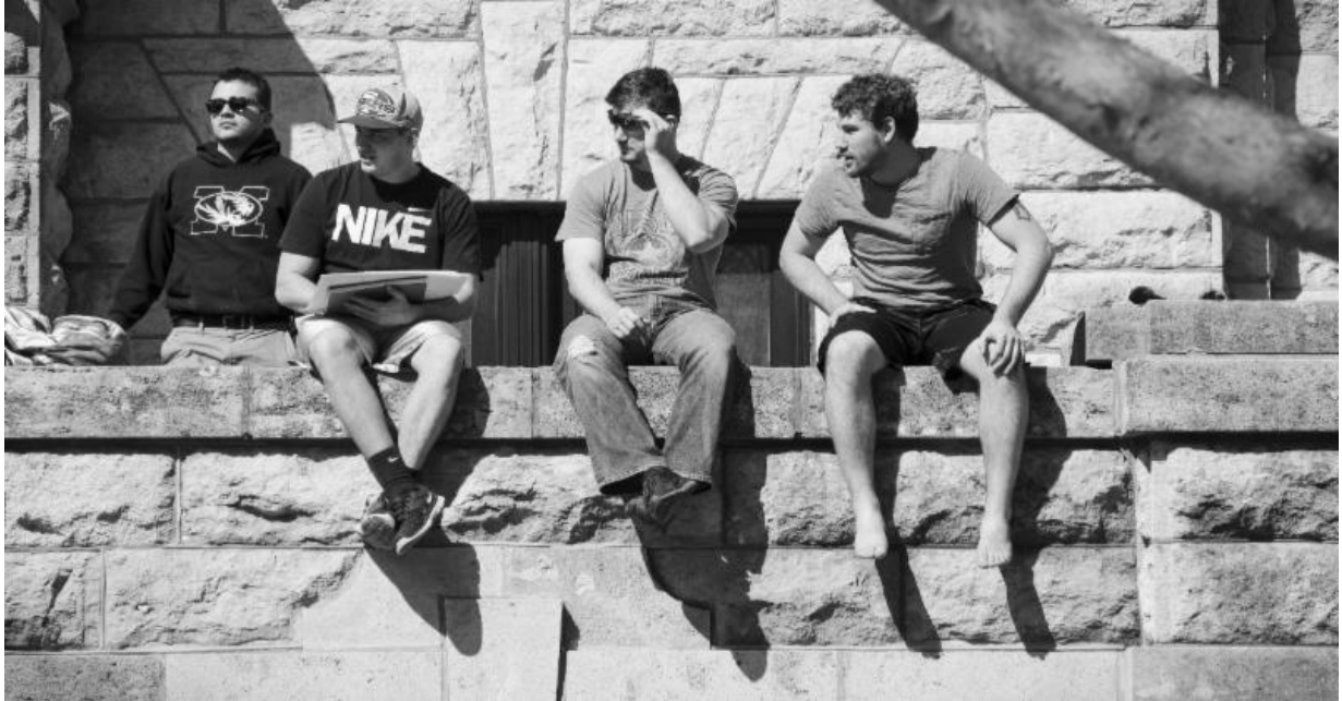
Students enjoying the weather and mapping the plaza-