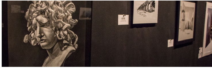
Images from the 2014 competition