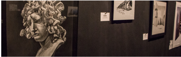
Images from the 2014 competition