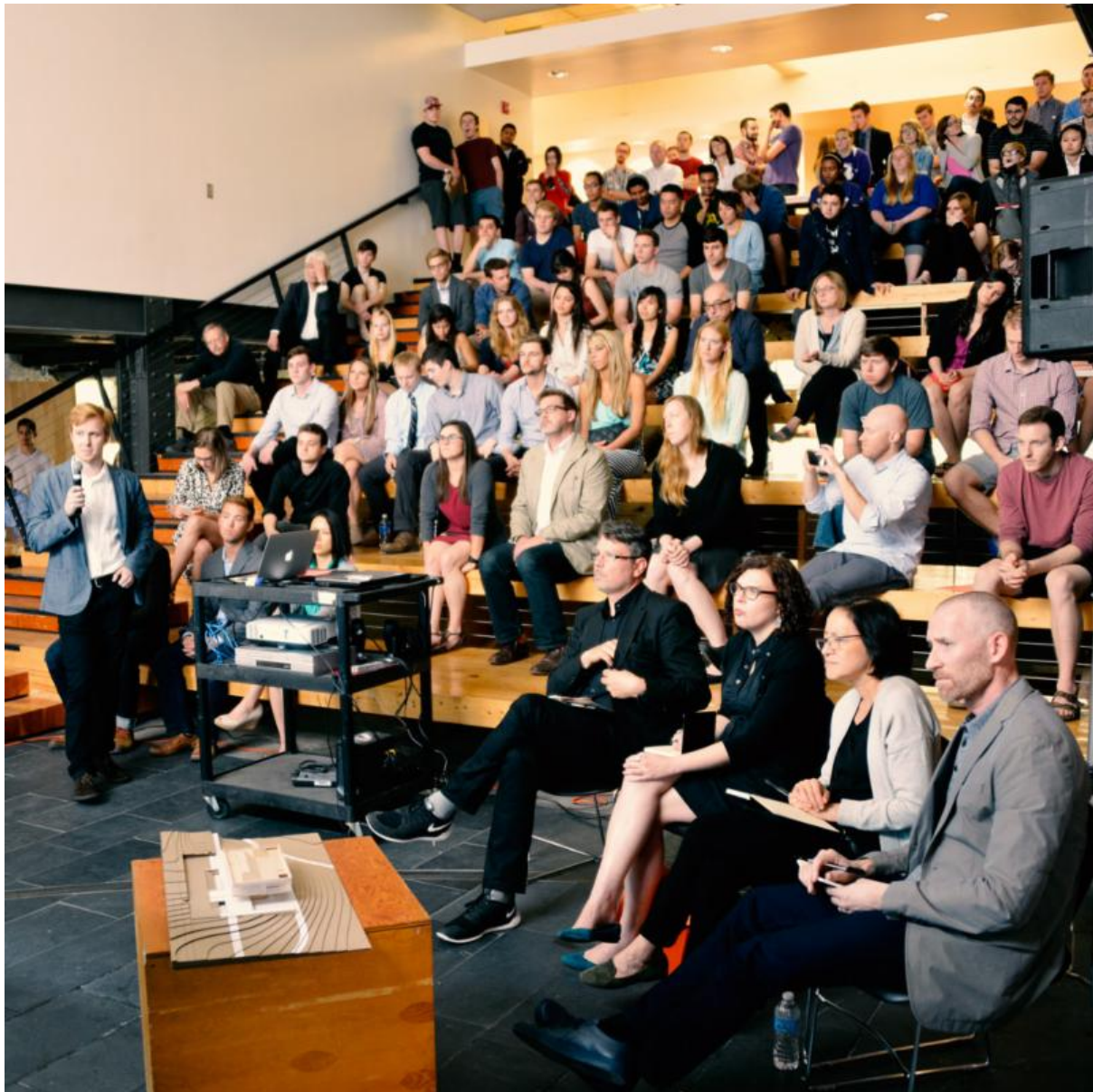
Heintzelman/Kremer Competition

THE COLLEGE of ARCHITECTURE, PLANNING & DESIGN // K-STATE