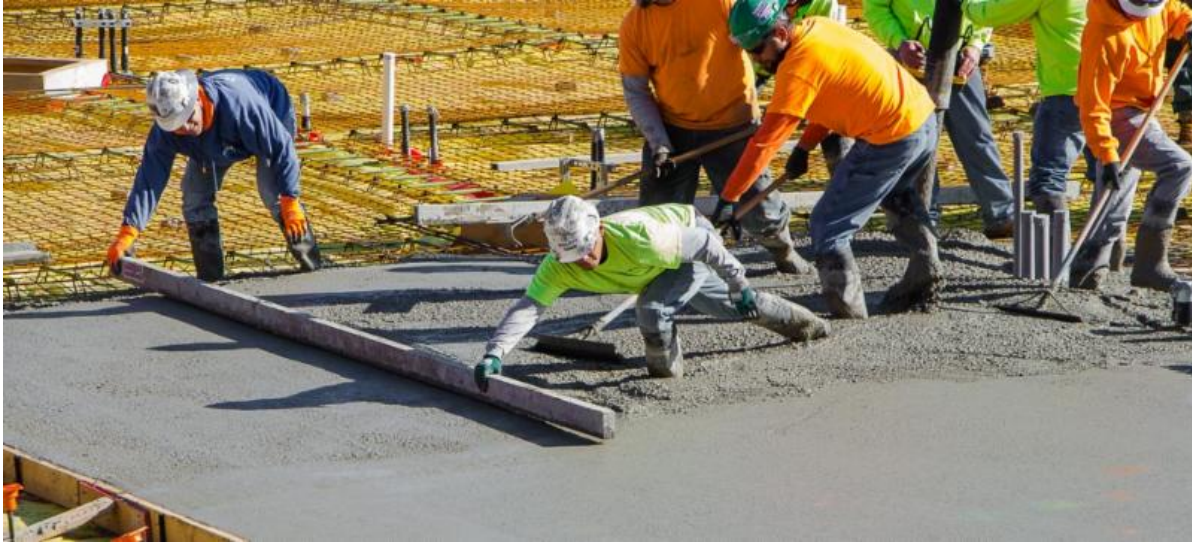
Pouring concrete this morning

College of Architecture, Planning &amp; Design