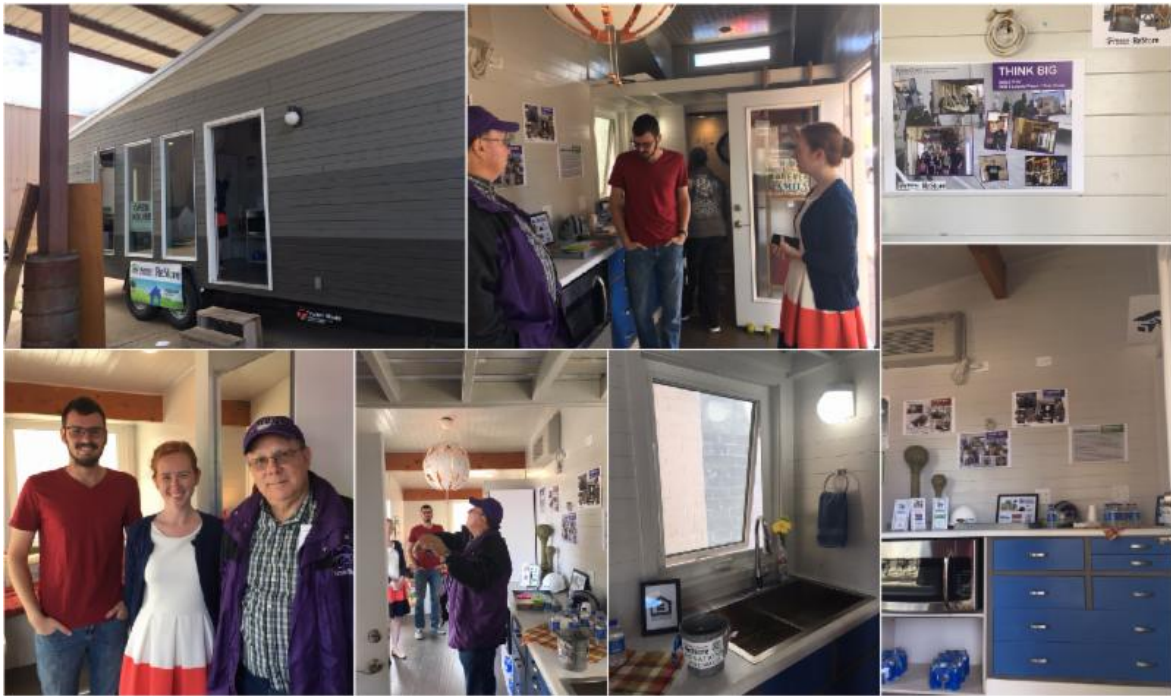
Images from 2nd Year IAPD tiny house event. Project was in collaboration with ReStore.