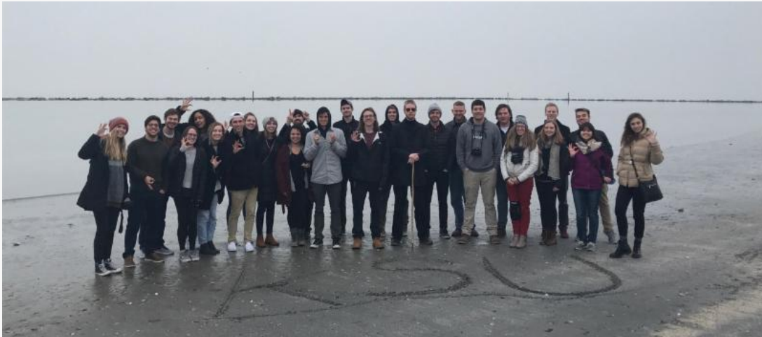
APDesign Italian Studies Program Spring 2018 Field trip to Urbino and Ravenna. Picture taken on the shore of the Adriatic Sea.