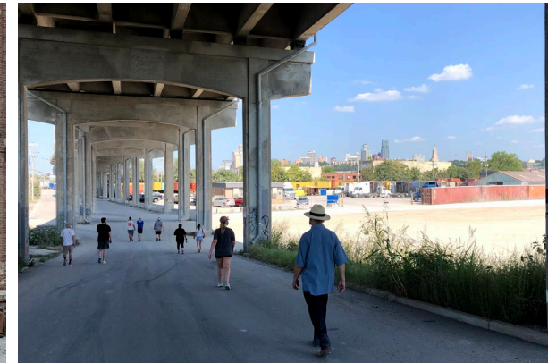
KCDC student experience (photographs). Images taken from variety of student experiences from 2018-2021. Retrieved from KCDC archives