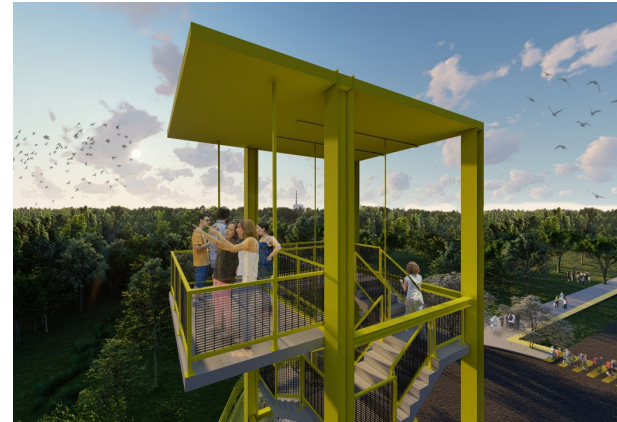
KCDC Project renderings (rendering). All renderings from KCDC projects spanning 2018-2021. From top left, clockwise: KCK Industrial Riverfront Vision Study, West Bottoms Reborn Vision Study, East Bottoms Vision Study, Prospect Avenue Vision Study.