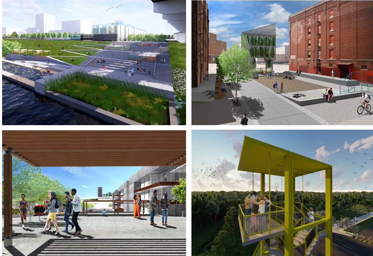
KCDC Project renderings (rendering). All renderings from KCDC projects spanning 2018-2021. From top left, clockwise: KCK Industrial Riverfront Vision Study, West Bottoms Reborn Vision Study, East Bottoms Vision Study, Prospect Avenue Vision Study.

Located in the heart of downtown Kansas City, the Kansas City Design Center (KCDC) is a nationally-recognized, service-learning urban design program that operates as a 501(c)3 nonprofit partnership among local civic leaders, professional designers, and the architecture and planning programs at the University of Kansas and Kansas State University.